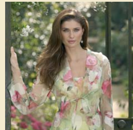
Chianti sheer floral jacket (above) and matching ensemble in shop window (left)