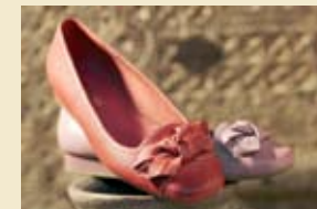
Firth's stocks a selection of stylish footwear with a wider fit.

I like to look smart. Nikki has a talent for buying clothes that are fashionable but not slavishly so; that suits me perfectly. I also like the fact that I can get a whole outfit with a matching bag and shoes."