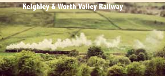
Keighley & Worth Valley Railway

It's easy to take the railway for granted, what with trains being such a part of the fabric of the valley for so many years, with trains running on the branch line since 1867, bar the handful of years between 1962 when the Preservation Society was formed and was busily restoring the line ready for reopening in 1968.