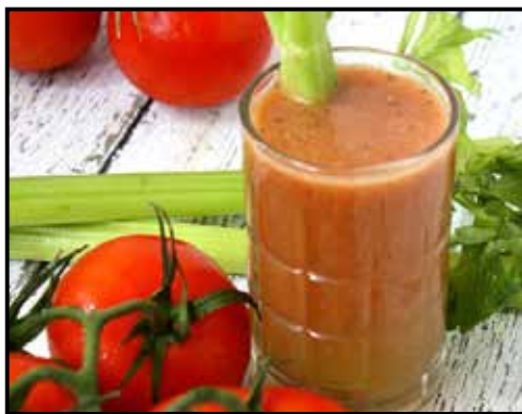
Haworth Wholefoods and Worth Valley Mag bring you fresh juice recipes to celebrate the launch of Haworth Wholefoods fruit & veggie boxes.

This juice is basically a Bloody Mary for the 21st century. You can take it whatever way suits your temperament or mood. Keep it clean and cosmic or go full on galactic with vodka & spice. Either way, it will put a zing in your Christmas step and a smile on your face. It may be winter but use the best tomatoes available, and make sure they are ripe! Add horseradish for additional pucker power. The garlic and jalapeno are antimicrobial, in other words, they will blast out whatever bacteria or fungi ails you! (Just tell friends it is a medicinal thing) Have yourself a very Merry Naughty but Nice Juice. Cheers!