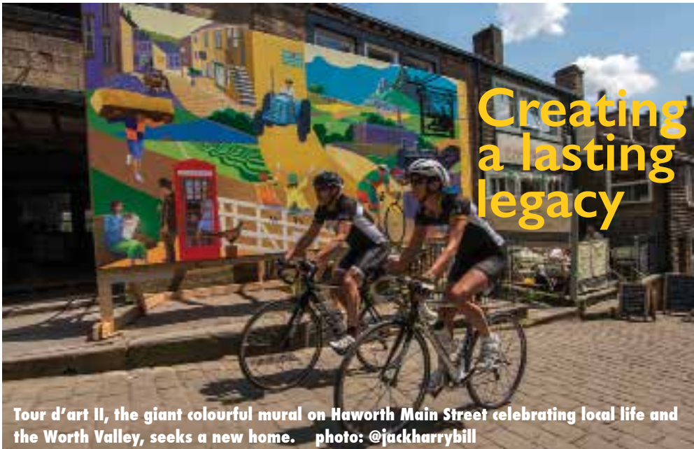
Tour d'art II, the giant colourful mural on Haworth Main Street celebrating local life and the Worth Valley, seeks a new home.