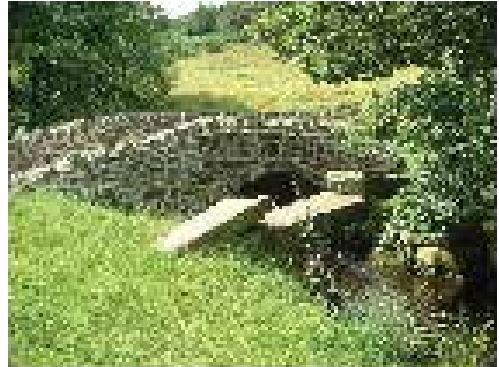
Chapels and stone archway at Newsholme Dene