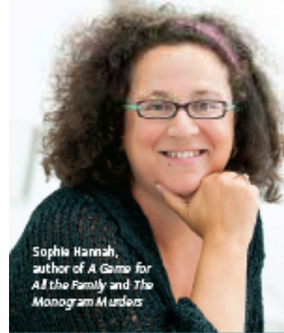
Sophie Hannah, author of A Game for All the Family and The Monogram Murders