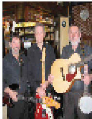
The Beer House Boys Live - and Jazz!