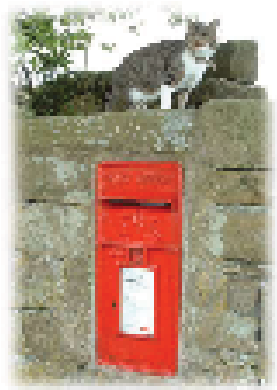
Postbox at Newsholme Dene

City of Bradford Metropolitan District Council Countryside & Rights of Way