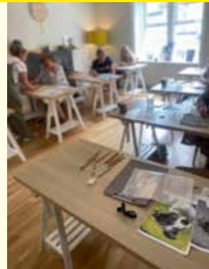
The Classroom, a dedicated creative space, is located upstairs at 60 Main Street.

New to Haworth Main Street this summer is an exciting new creative studio. Branching out from the popular ceramics café, Cobbles & Clay will be expanding