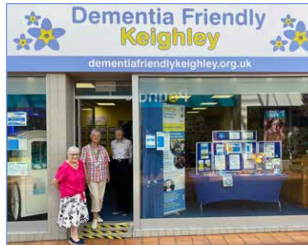
Dementia Friendly Keighley information and support centre is conveniently located in the Airedale Shopping Centre, Keighley, opposite PoundLand.