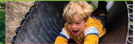
WELLY WALK 27 May - 29 October