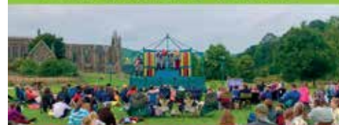
ILLYRIA OUTDOOR THEATRE 29 July & 12 August