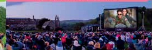
LUNA OUTDOOR CINEMA 22 & 23 August

ENQUIRIES: 01756 718009 | info@boltonabbey.com | boltonabbey.com