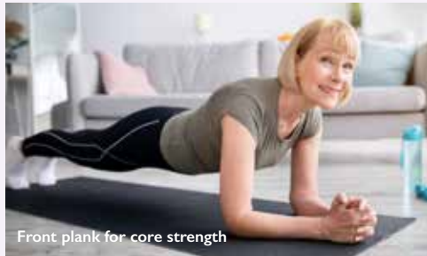
Front plank for core strength

The phrases 'core strength' or 'core stability' are amongst a list of current "buzzwords" used in the world of health and fitness. Everybody can benefit from improving their core strength in order to prevent pain and injuries around their spine, hips and shoulders.