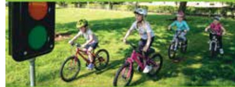
FAMILY CYCLE ZONE 6 May - 24 September