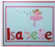
Personalised wall hanging designed by Sweetpea & Rose